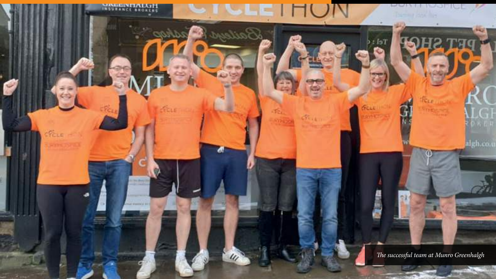
The successful team at Munro Greenhalgh