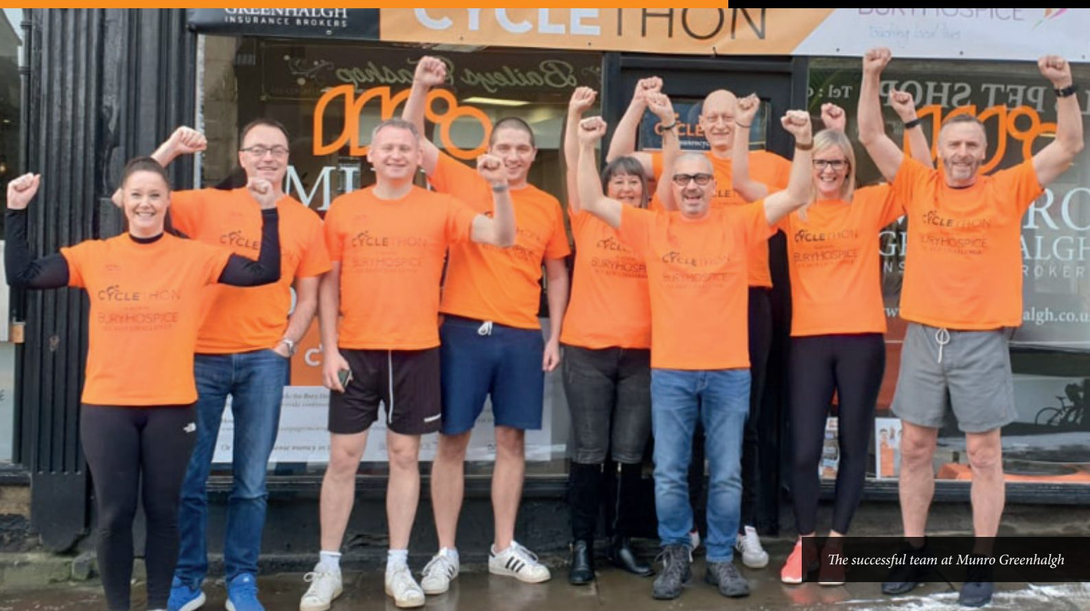
The successful team at Munro Greenhalgh